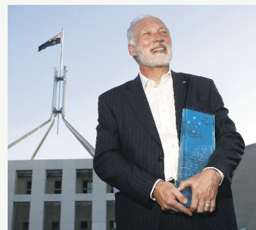
Prof McGorry receiving the Australian of the Year Award

ment of preventive and early intervention strategies for emerging, potentially serious, mental disorders in young people, aged 12 - 25 years. This involves service development, clinical trials and studies examining the clinical neurobiology of the onset phase of psychotic, mood, and substance use disorders. With an emphasis on early intervention and a commitment to educating the community to the early signs of mental illness, Professor McGorry's extraordinary 27-year contribution has transformed the lives of tens of thousands of young people the world over.